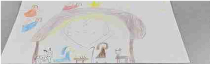
1 st Grade - Maddy Wells