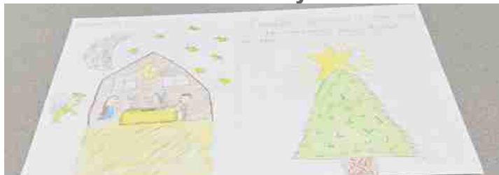
5 th Grade - Brooklyn Vanderbranden