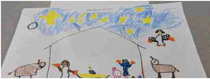
Kindergarden – Theo Simpson